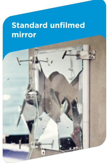
Anti-shatter test - TÜV Rheinland